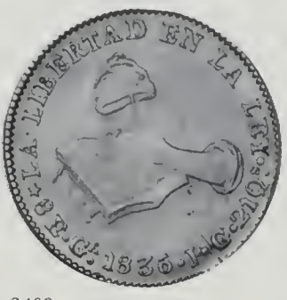
Lot No. 2409